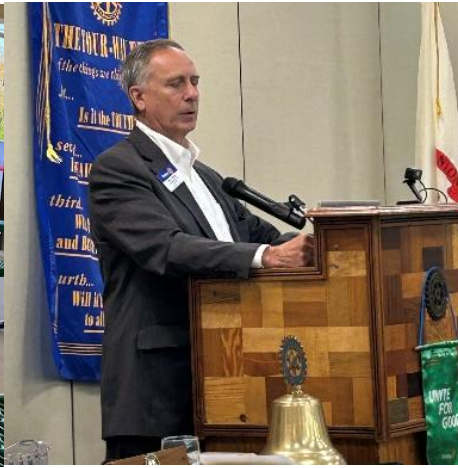
Presiding at a regular Tuesday Rotary Meeting