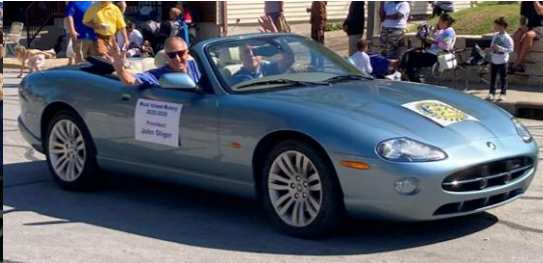
Rock Island Labor Day Parade