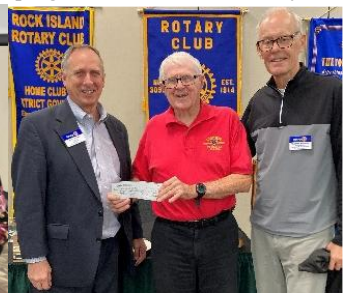
Received Water Filter Project Donation