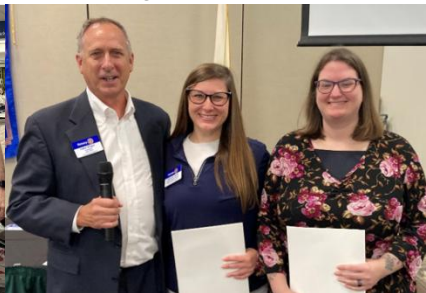
Inducted nine new Club Members