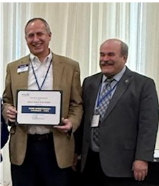
Accepting District Award