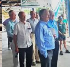
Touring Modern Woodmen Park