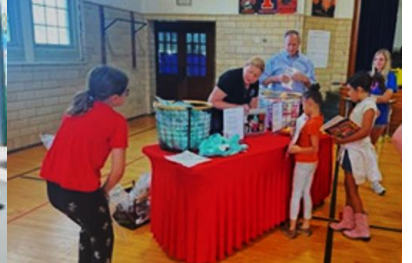
Helping with District Grant Project