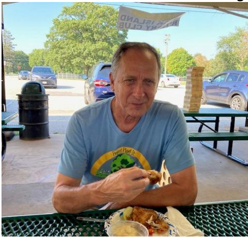
Enjoying the Rotary Family Picnic