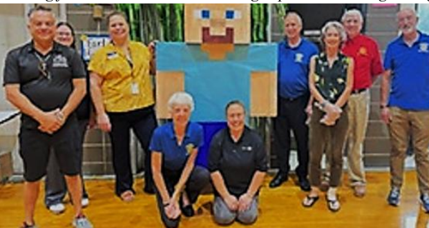
Helped Serve at Earl Hanson School's "Donuts with Grownups"