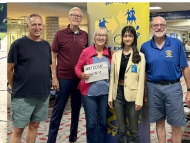
Greeting Japanese Exchange Daughter