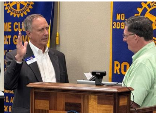
Swearing in as the 111 th Rock Island Rotary President