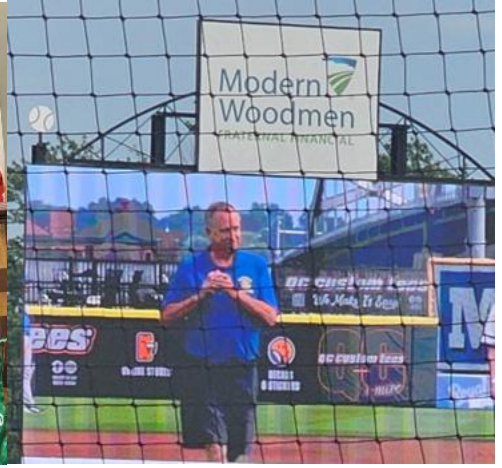
Firing the First Pitch at Rotary at the Ballpark