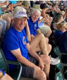
Chicago Cubs Trip