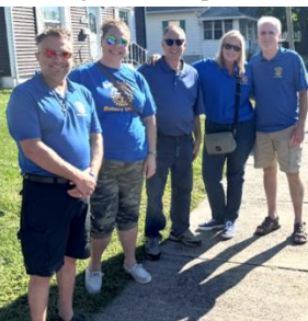
Waiting for Parade to Start