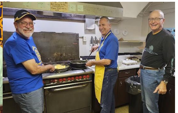
Frying Sausage for Rotary Pancake Breakfast Fundraiser