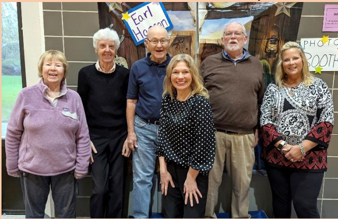
Here are our smiling Rotary volunteers!