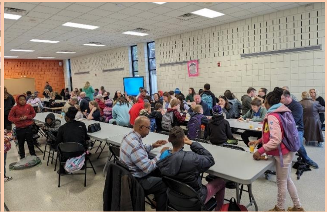
And here is JUST PART of the parents who attended!