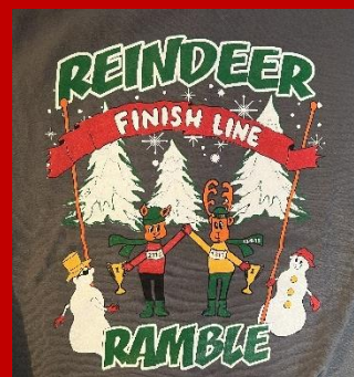
Prior Year Gray Sweatshirt