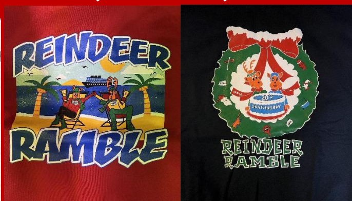
Prior Year Red Sweatshirt