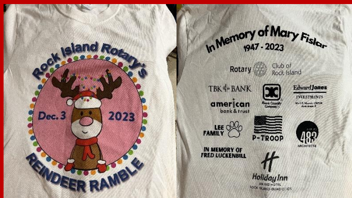
2023 Long Sleeved Tee Front

We have we got a deal for you!! We have a limited supply of Reindeer Ramble Sweatshirts from prior years and a limited supply of 2023 Reindeer Ramble Long Sleeved Tee Shirts available to you for just $10 each! Yep, you read it right, just $10 for your choice. But the quantity and sizes are limited. DO NOT DELAY! Contact Holly Sparkman at hksparkman@gmail.com . Tell her which shirt you prefer and the size you need. To be safe, you might want to give her a 2 nd choice in case the size you want is not available in the shirt you select. Here are your choices: