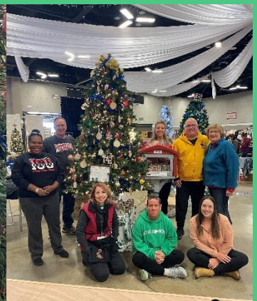
Crew Finishes the Project!