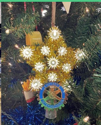
Rotary Logo Displayed Proudly