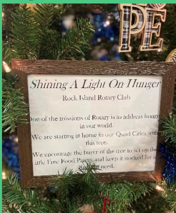
Tree Theme is Explained