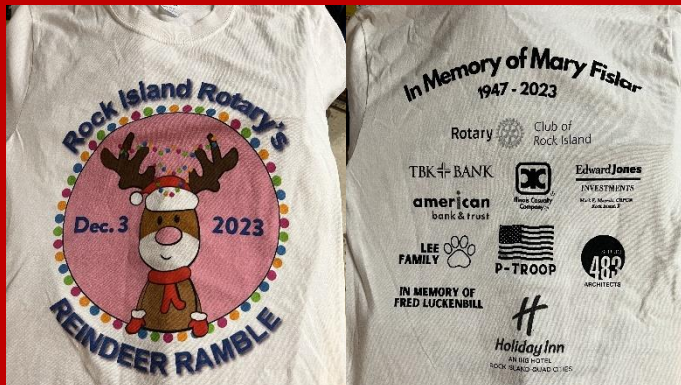
2023 Long Sleeved Tee Front

Well have we got a deal for you!! We have a limited supply of Reindeer Ramble Sweatshirts from prior years and a limited supply of 2023 Reindeer Ramble Long Sleeved Tee Shirts available to you for just $10 each! Yep, you read it right, just $10 for your choice. But the quantity and sizes are limited. DO NOT DELAY! Contact Holly Sparkman at hksparkman@gmail.com . Tell her which shirt you prefer and the size you need. To be safe, you might want to give her a 2 nd choice in case the size you want is not available in the shirt you select. Here are your choices: