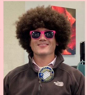
Is this what your banker looked like in the '70s?