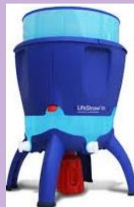
The Lifestraw "Community" Water Filter