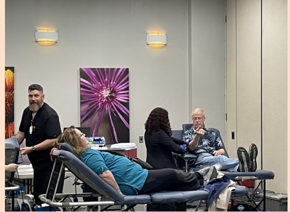
The Rotary Blood Drive in Action!