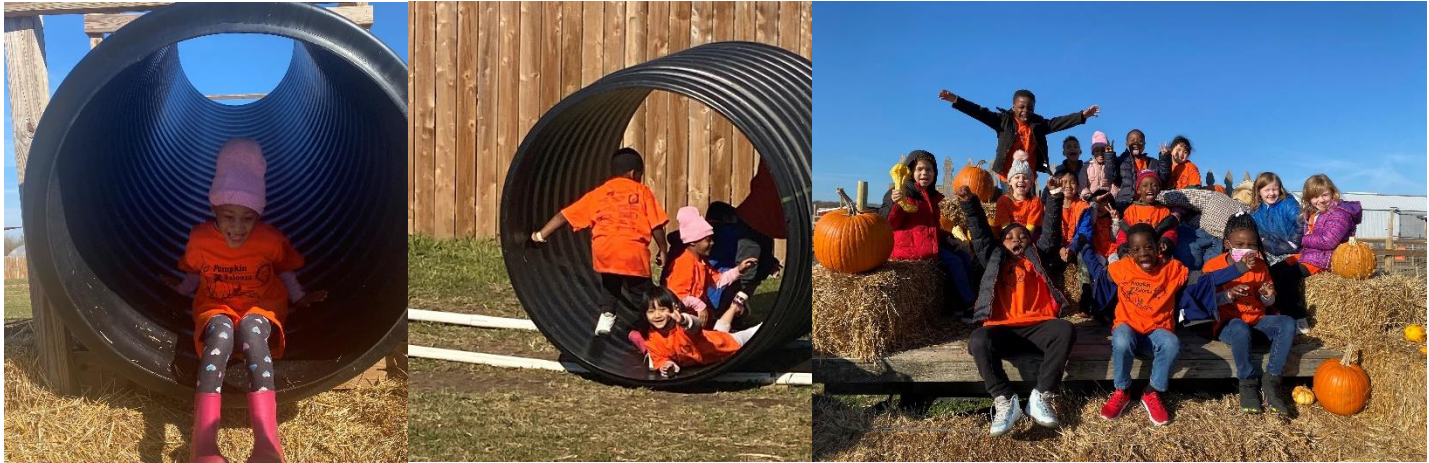
One of the teachers shared that the kids had the best time and several said it was "their best day ever". Pat yourself on the back! This wouldn't happen if Rotarians didn't organize and support our Club fundraisers that provide the funds for activities like this. Note the tee shirts that our Club purchases and gives to every student! Thank you!