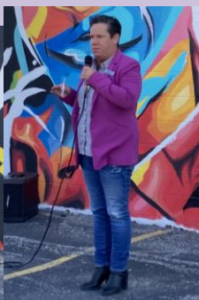
Pres. Cindi Speake