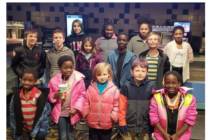
Some of the children from their youth programs.