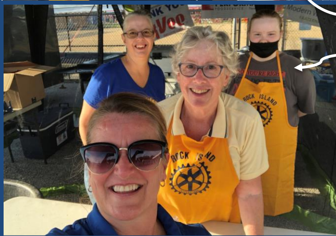
Rocky Interact Club Helpers