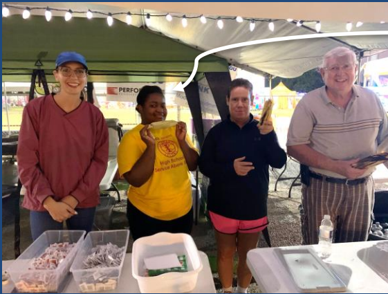
Rocky Interact Helper