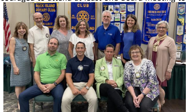
Newly Installed Officers and Directors for 2022-23