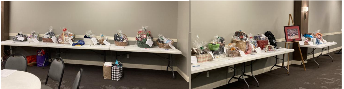
Some of the Trivia Night Silent Auction items