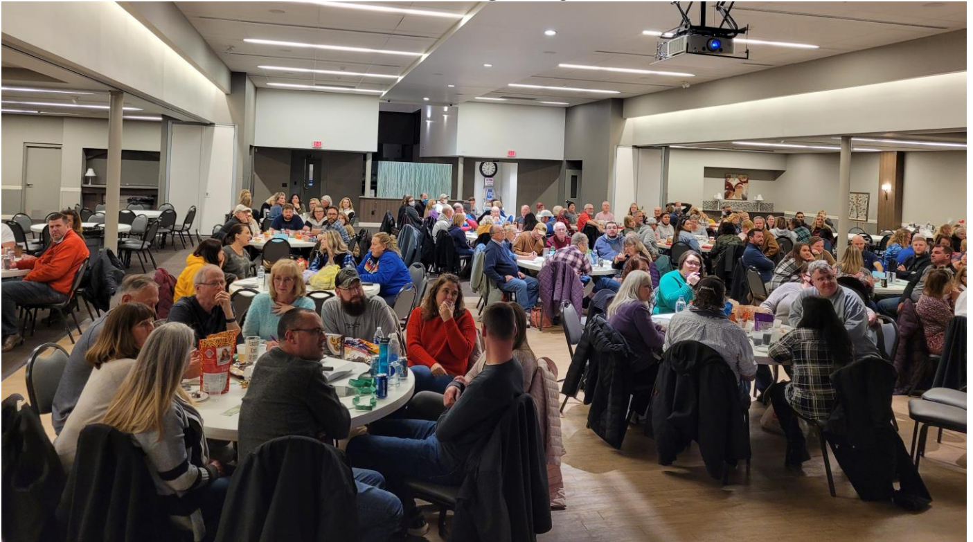
View of part of the crowd attending Rotary Trivia Night 2021