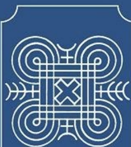
Hannunvaakuna Finnish Good Luck Symbol