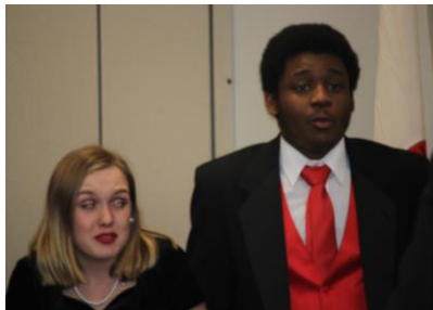
Watch out, Santa is coming!