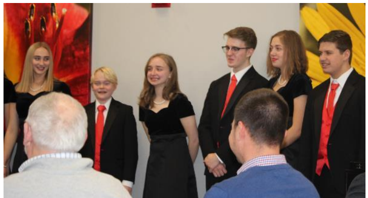
Singers having some very obvious fun entertaining Rotarians!!