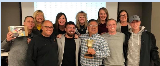
Moline Rotarians celebrate winning the "Smartest Club" Trophy!