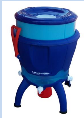
Life Straw Water Filter