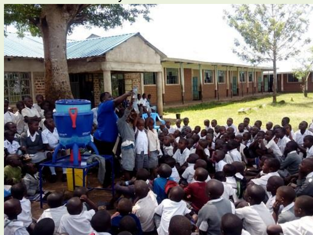
SANGO Primary School