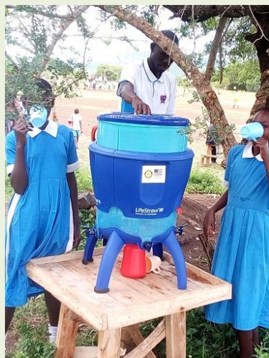
LOGINGO Primary School

Thanks for being an amazing partner in this life-saving mission of providing clean water!