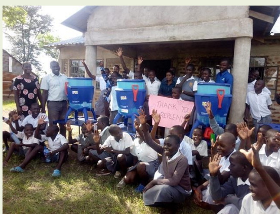
SANGO Primary School