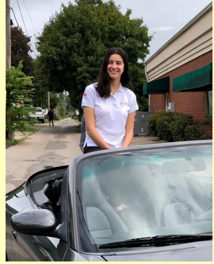
Labor Day Parade 2018