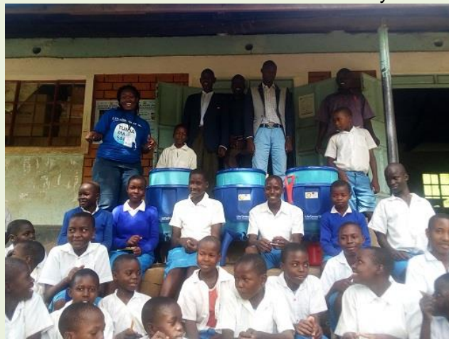
MWIRARIA Primary School