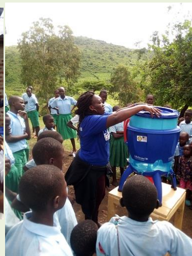
NYAWACHA Primary School