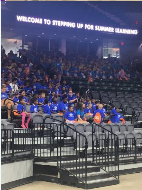
Campers Listen Intently