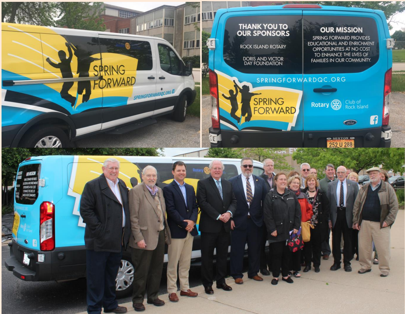
Rock Island Rotarians gather for the Community Unveiling of the new Spring Forward van.

Rock Island Rotary made the lead donation the lead to Spring Forward's purchase of a new 15-passenger van. Along with a significant contribution from the Doris & Victor Day Foundation, Rotary's grant enabled Spring Forward to make the purchase which will be used to transport children to and from after-school programs and summer enrichment camps as well as on field trips throughout the year. It will also be used to transport adult students in Spring Forward's Family Literacy Program. The community unveiling of the new van took place in the Botanical Center parking lot just prior to this week's Rotary meeting.