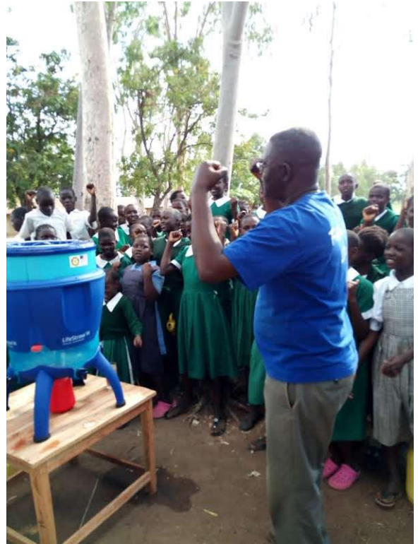
Blue uniform: Sino SDA Primary School