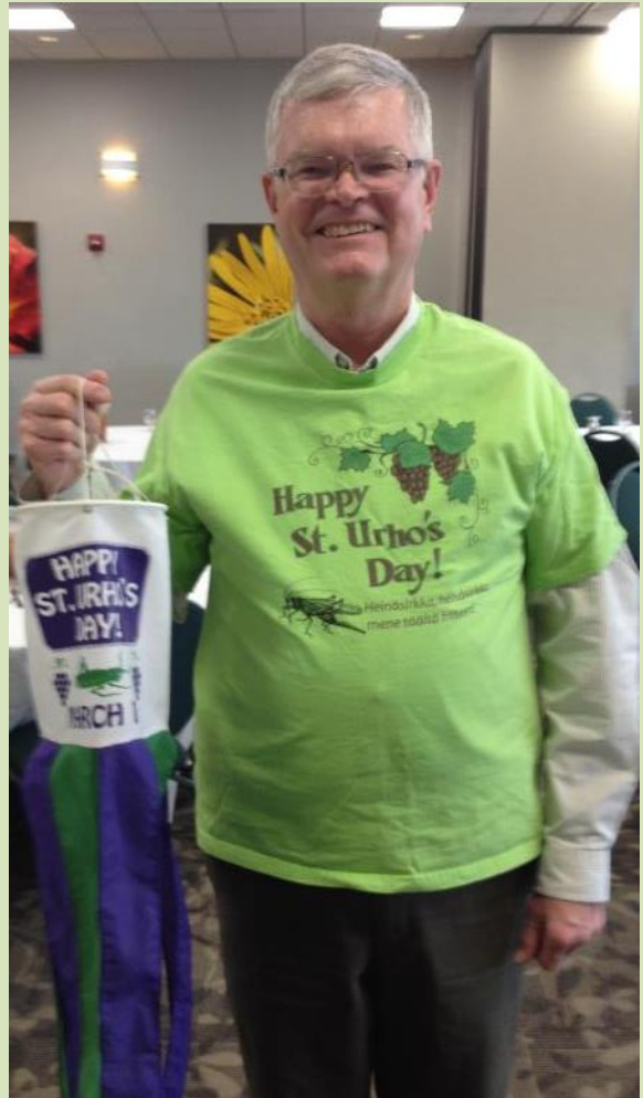
All Dressed Up and Ready for Lunch!