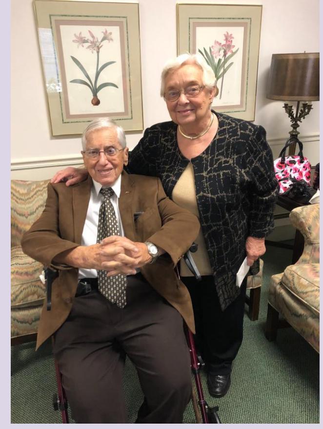
And 65 years in Rock Island Rotary!