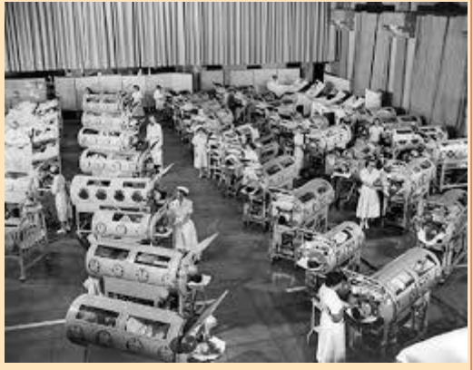
Rows of iron lungs give Polio victims life ... temporarily.

Many who were fortunate to live are crippled for the rest of their lives.