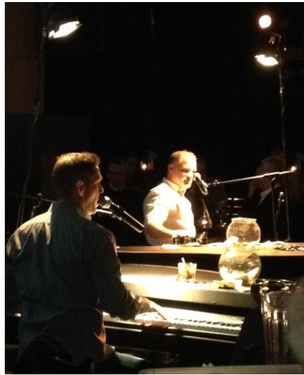
Tremendously Talented Entertainers!!