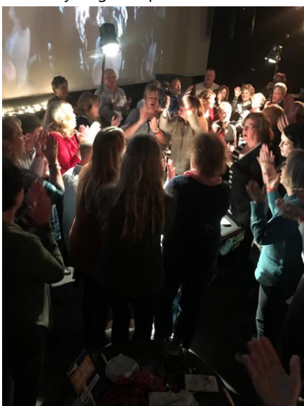
Fun Lovers Surround the Pianos