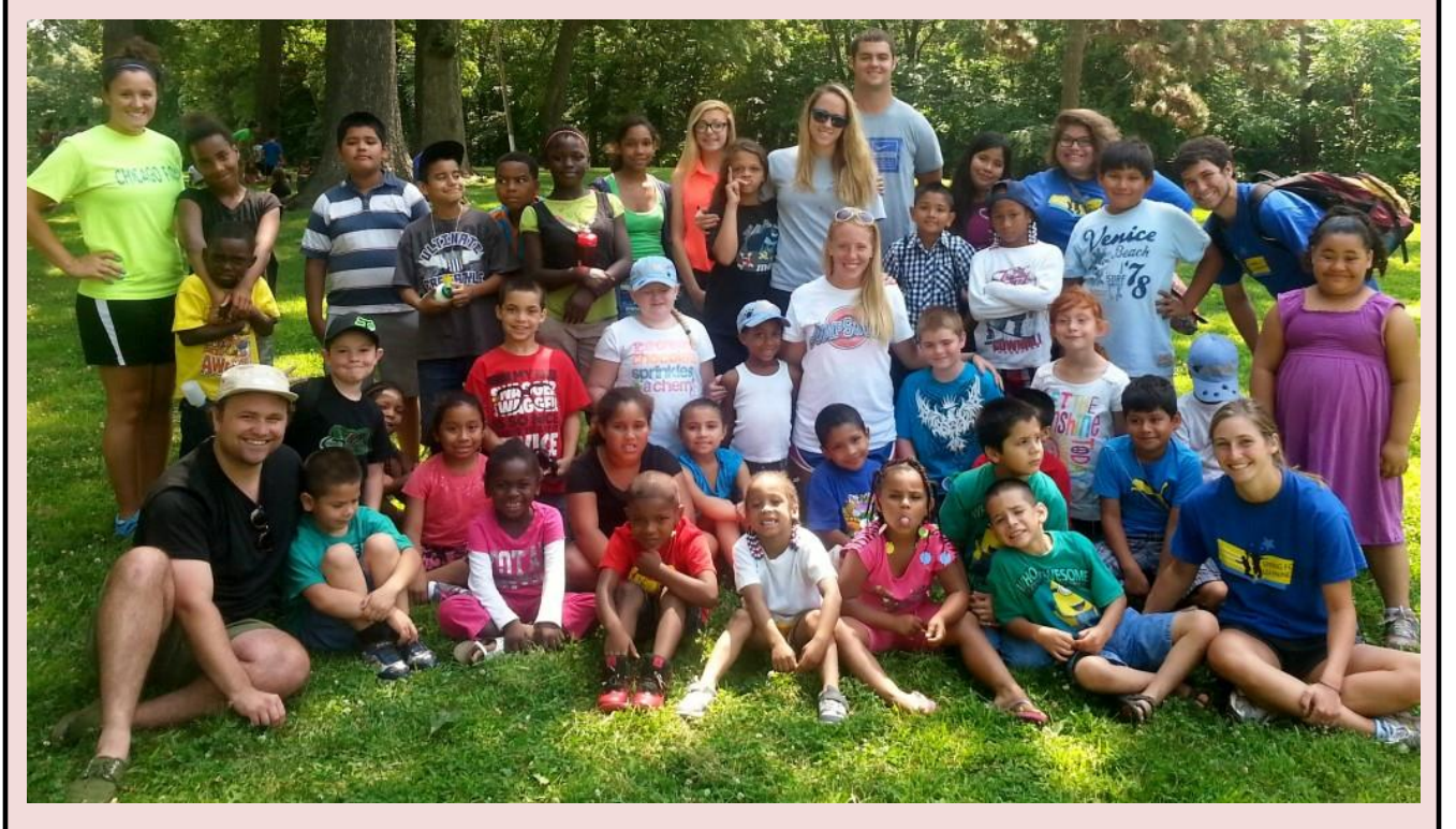
Campers and teachers from one of the 5 SEI camps take a moment to pose for a group photo.

Rock Island Rotary can take great pride in our participation in this program funding in part directly by our club and a Rotary District 6420 matching grant obtained by our Club.