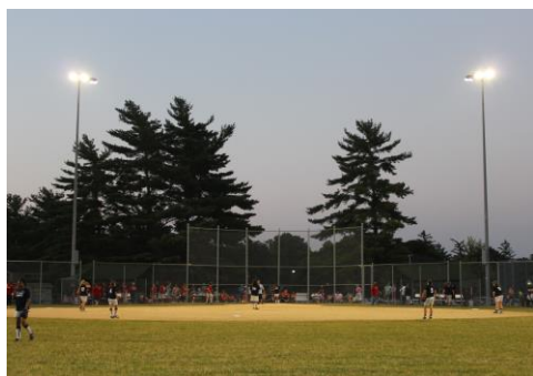
A Major League Baseball grant paid for lights