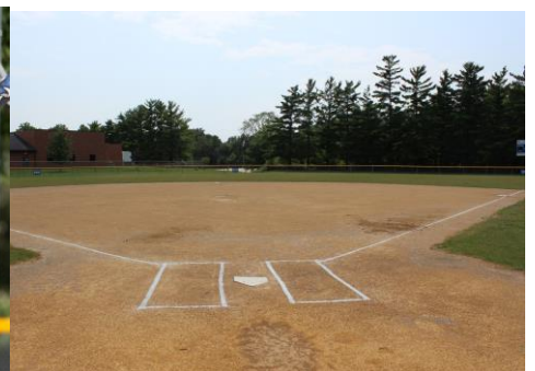
New Field is fenced with sprinkler system