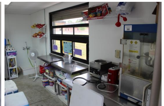
New building houses concessions, restrooms, and off season equipment storage.