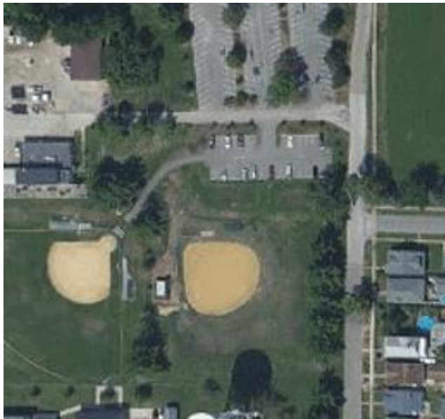
Finished new field on left, under-construction "Lower field" on the right. The Hauberg Mansion is just North.