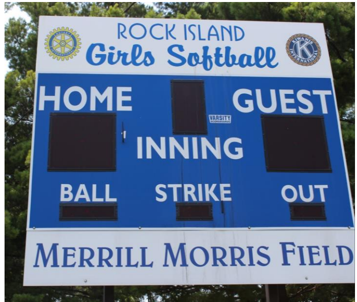
Scoreboard at new field donated by Rock Island Rotary and Kiwanis clubs.