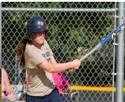
It's All About the Girls!