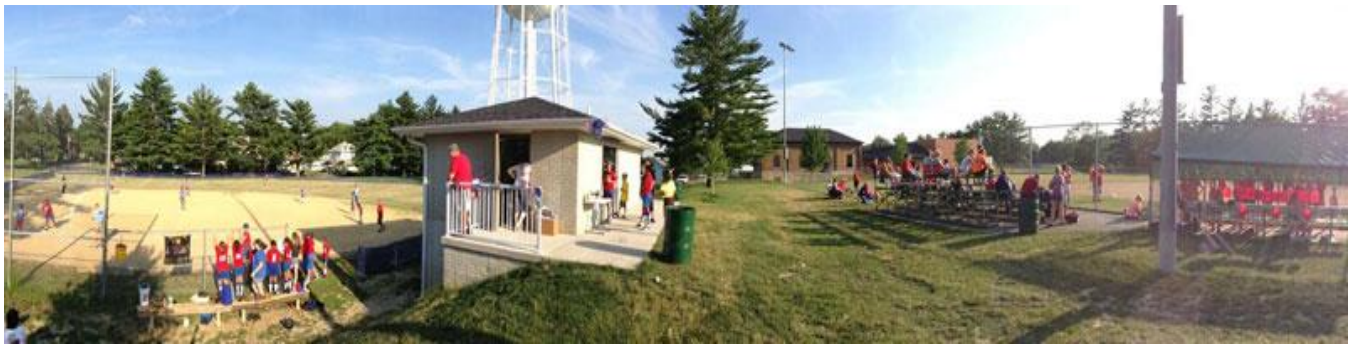
Summer of 2015, new upper and lower fields and concessions building in full use!

Images of Rock Island's Girls Softball League complex.