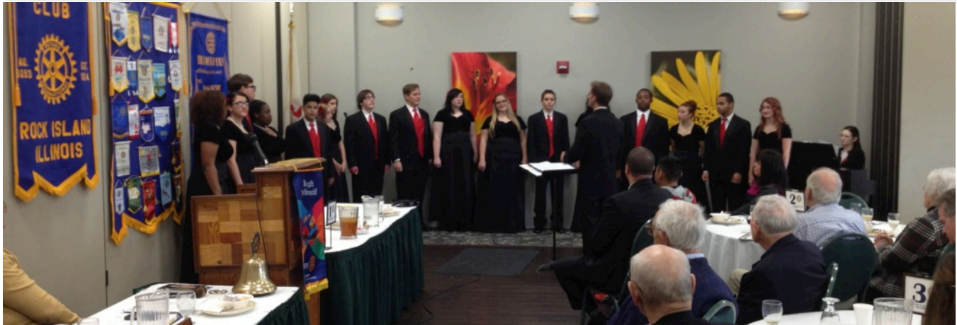
The Rock Island High School Chamber Choir entertained the RI Rotary with holiday songs!