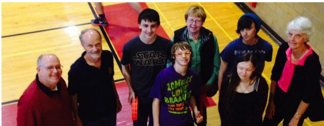
Rock Island High School Interact Club members and Club Members pause for a photo at the Interact Student/Staff Basketball game at Rock Island High School.